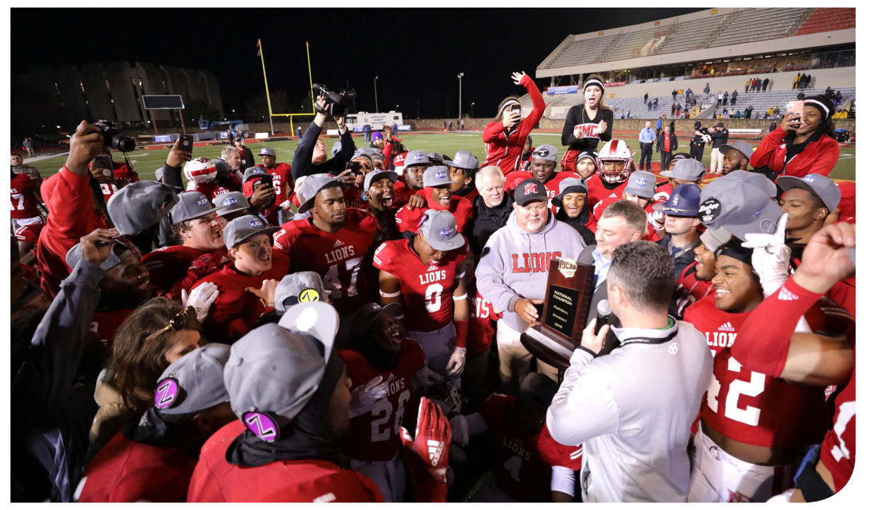
The EMCC Lions earned their fifth NJCAA football national championship - and second time with back-to-back titles - with their 10-9 victory over No. 2 Garden City during this year's championship game played in Pittsburg, Kan.