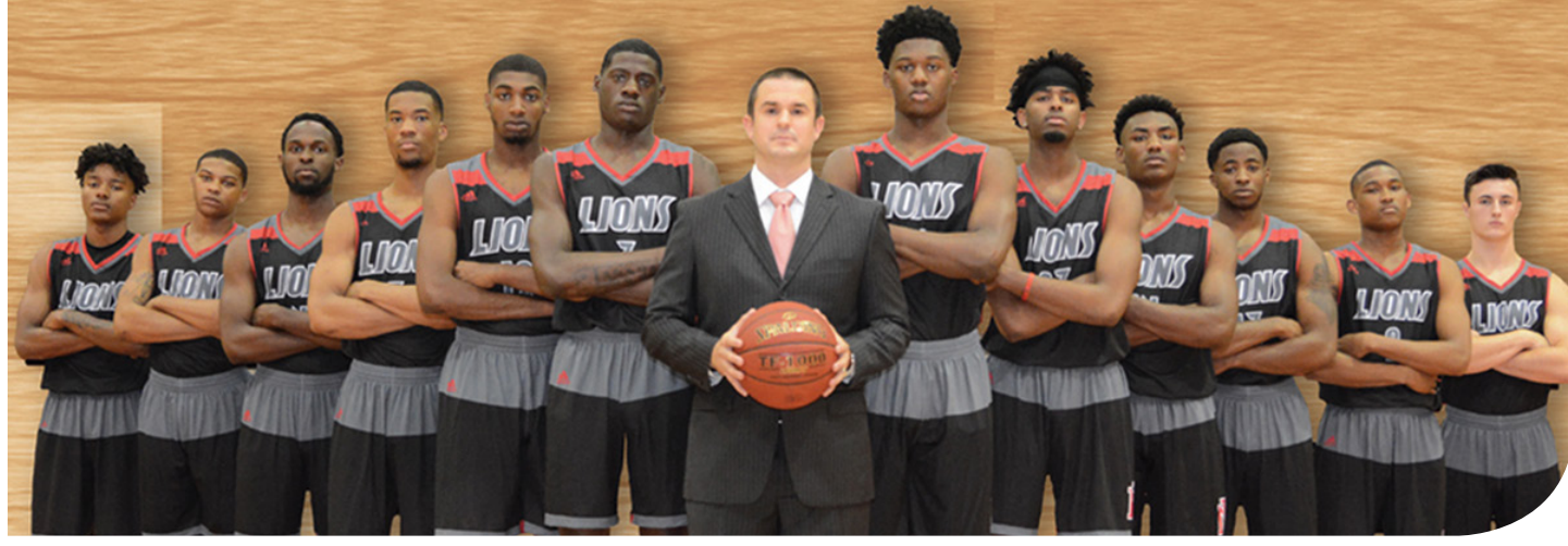
With eight sophomores on their 2018-19 men's basketball roster, the EMCC Lions look to be championship contenders within the talent-laden MACJC during the 2018-19 hoops campaign.